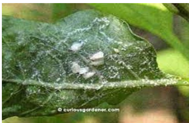
Figure 1: Whiteflies on chilli leaf

Peradeniya, as per the recommended practices of the Department of Agriculture and one-month-old and flower-initiated plants were used in the experiment. These plants are kept inside the mass-rearing insect cages of B. Tabaci for 3 weeks for egg laying. Afterwards, three plants each were kept separately in three insect cages (03 replicates) and used for treatment to introduce the parasites. Another three insect cages with three plants infested with eggs of B. Tabaci were used as control treatment. Insect cages are kept in the laboratory and maintained at 20°C throughout the experiment.