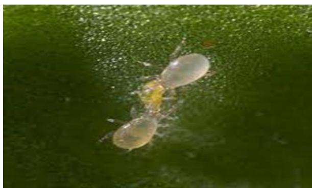
Figure 2: A. swirskii mites