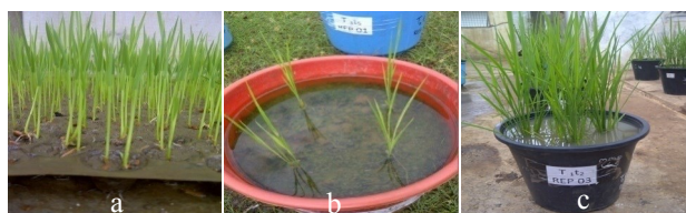
Figure 1: Several stages of the experiment. a) Seedling nursery; b) Experimental unit just after seedling establishment; c) appearance of the experimental unit 30 days after transplanting

All other management practices including watering were identical for all treatments. Rice plant growth and yield parameters, induced resistance to insect pests and grain quality parameters were taken 30, 60 and 90 days after transplanting and at the harvesting. Randomly selected three plants from each replicate were used for data collection. The experiment followed the Randomized Complete Block Design with 3 replications. In order to analyze significant differences, one factor analysis of variance with the level of significance \alpha=0.05 was carried out. Duncan's multiple range tests were performed for multiple pair wise differences across treatments.